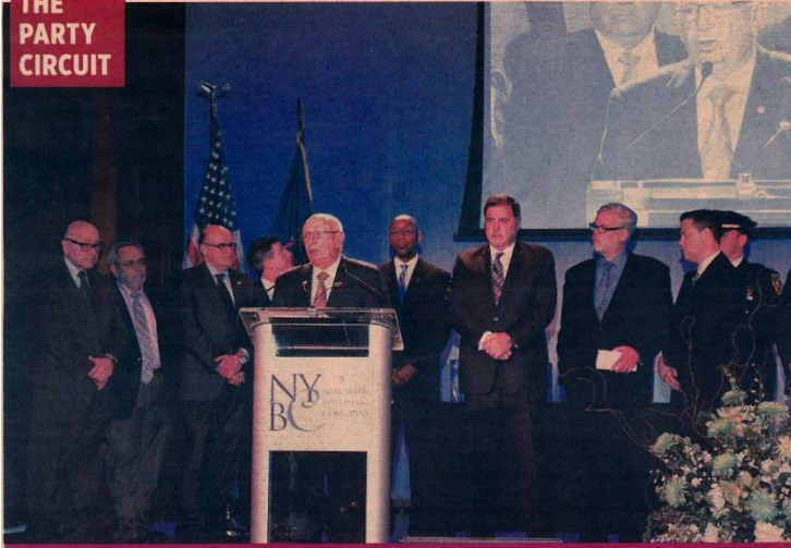
PORT AUTHORITY AWARD PRESENTATION